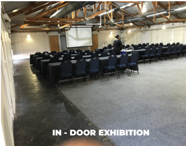
IN - DOOR EXHIBITION