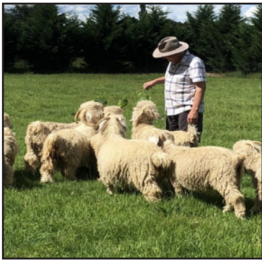
BERG WEAVING - Hand made Mohair products